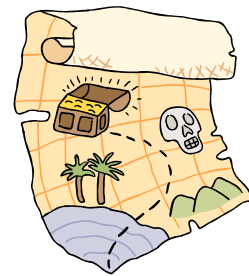
Pineapple a sign of good fortune

Practice model listening skills with your child for school success